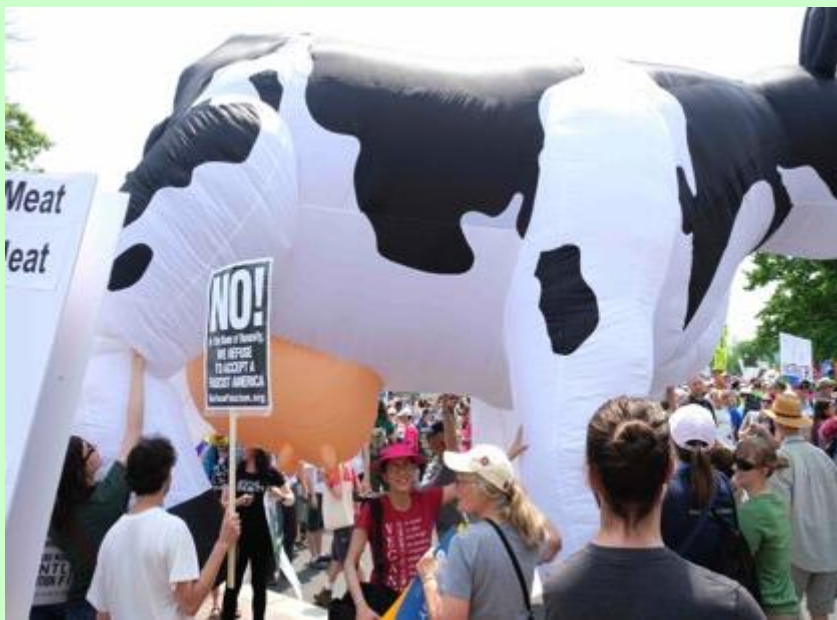
People's Climate March 2017 in Washington, D. C.