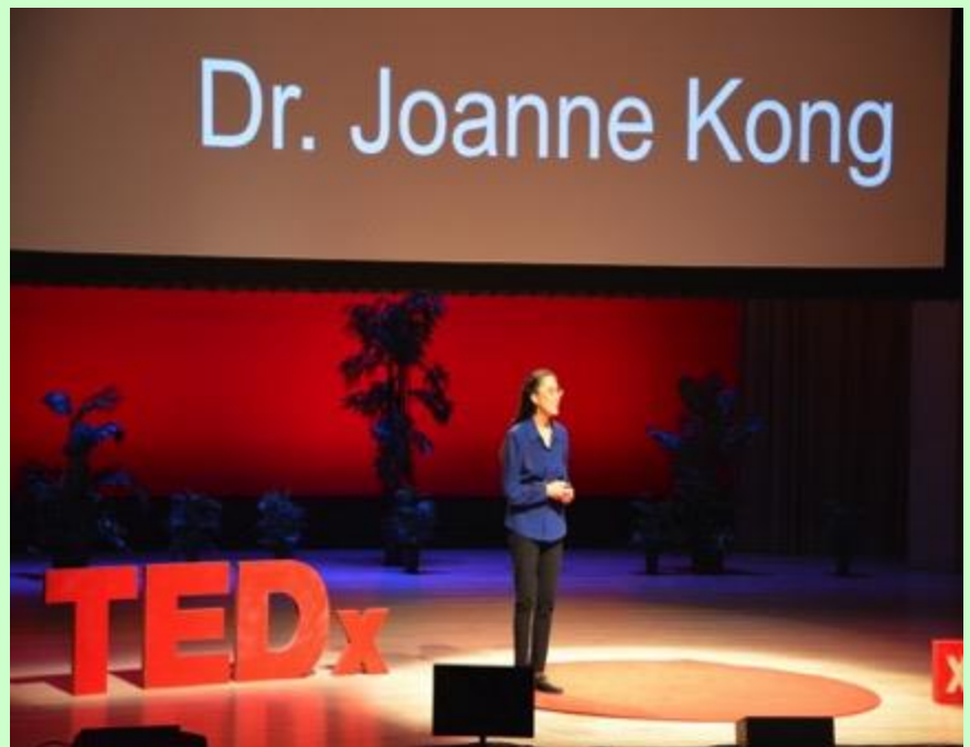
TEDx Talk, 2016